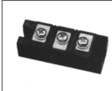
QR_3310001 Fast Recovery Diode Module 100 Amperes / 3300 Volts