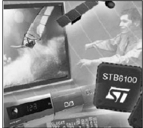
Figure 1. Package (420 + 36 PBGA 27 x 27)