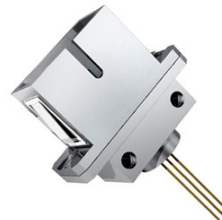
PD070-HL2-5xx SC Receptacle