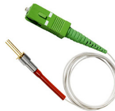
PD070-HL2-3xx SC/APC Pigtail