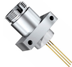
PD070-HL2-5xx FC Receptacle