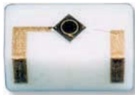
PD500-0xx Ceramic Sub-Mount