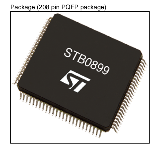
Figure 1. STB0899 DVB-S2 set-top box

The interface between these devices has been designed to ensure simple layouts and the lowest possible bill of materials cost.