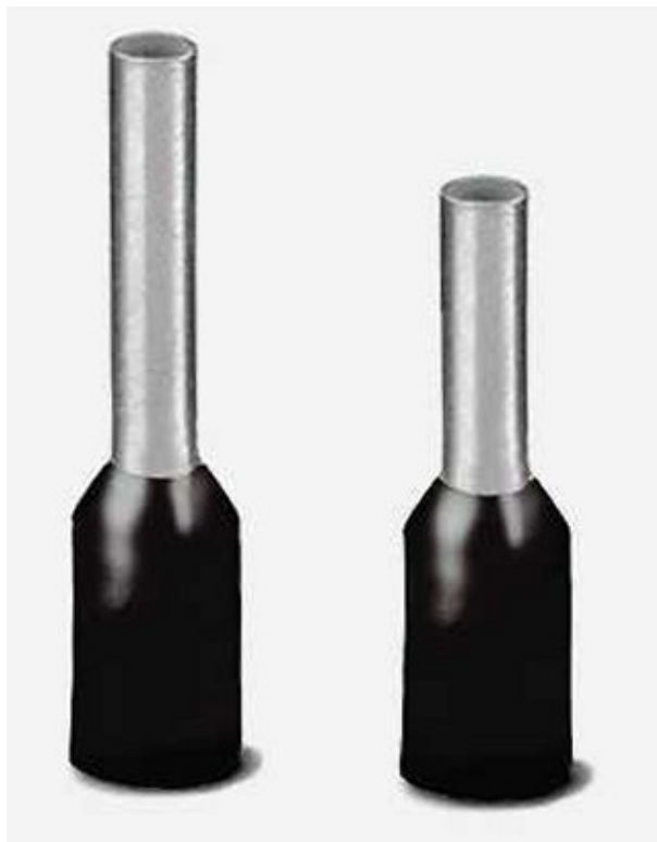
Ferrules with plastic sleeve, color range 1