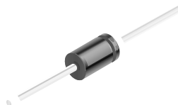
DO-35 Glass case COLOR BAND DENOTES CATHODE