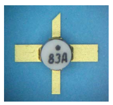
GATE LEAD IS ANGLED