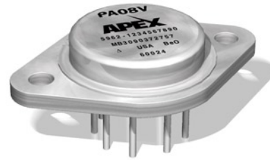
8-PIN TO-3 PACKAGE STYLE CE