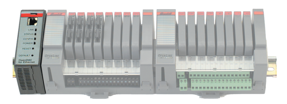
ETHERNET UNIT ON OPENDAC® SYSTEM