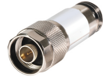
CASE STYLE: FF779