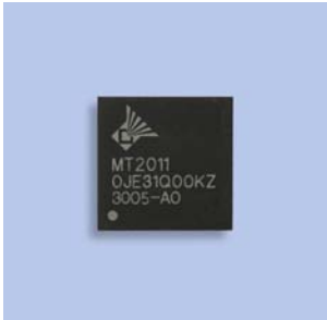
MT2011 Single-Chip Broadband Tuner

The MicroTuner MT2011 is a fully integrated single-chip tuner, optimized for digital OpenCable compliant STB applications.