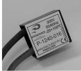
P-1240-016 (Single Phase)