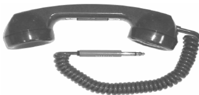
FHS Firefighter's Handset

This handset comes with a coiled cord. The attached plug fits Firefighter's Phone Jack, Model FPJ, allowing firefighters to make direct communications with a central control area.