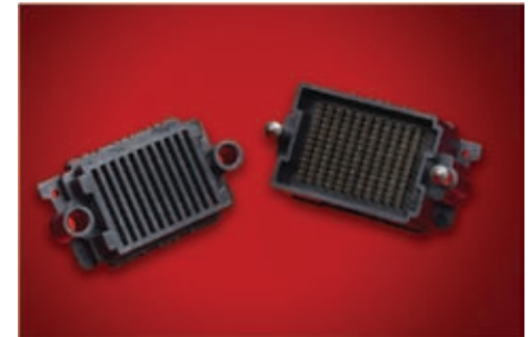
Left to right: HD Mezz Receptacle (Series 45802) and HD Mezz Plug (Series 45830)

Simplify PCB routing, maximize card-slot space and achieve speeds up to 12.5 Gbps with Molex's HD Mezz; designed for the large and growing high-density and high-performance mezzanine connector market