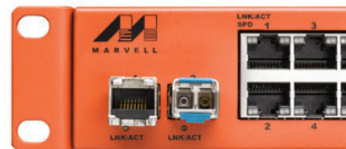
Auto-Media detect UpLink for copper or fiber