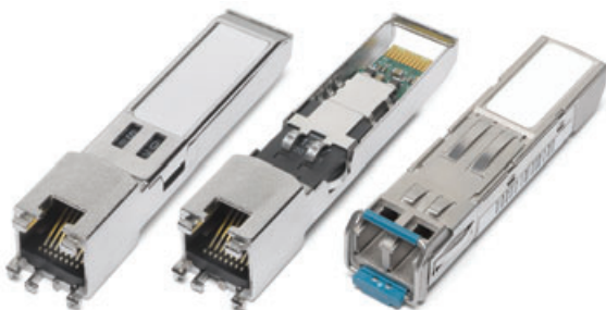
SFP modules: copper and fiber

The Alaska 88E1112 10/100/1000 Mbps Ethernet PHY offers an integrated, flexible solution for system level or SFP module applications. Supporting both copper and fiber media applications, with additional SFP module support, the 88E1112 is a key ingredient for any type of SGMII/SERDES/copper combination application. The small footprint facilitates SFP module applications, while the auto-media detect capability offers flexible media support.