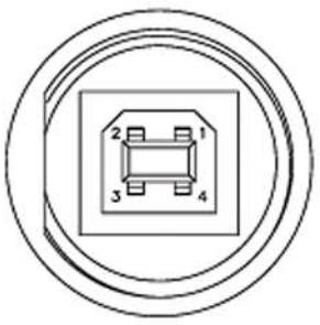
Pin Assignments Front View