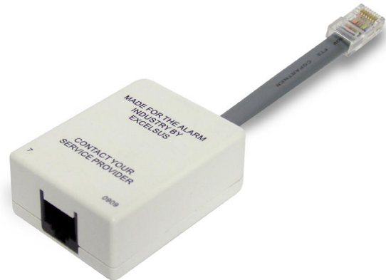
Z-BLOCKER® Z-A431PJ31X Alarm Panel DSL Filter