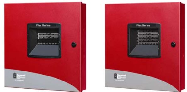
GWF402 (left) and GWF404 (right)