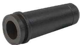
HN 14.109 PVC Strain Relief