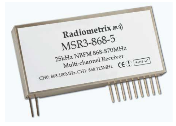
Figure 1: MSR3-868-5 receiver

The MSR3 is a 25kHz channel narrowband receiver intended for European 868MHz band Non-Specific SRD applications. The module offers a low power, reliable data link in an industry-standard pin out and footprint.