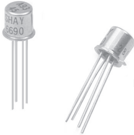
Product may not be to scale

The four pin TO-18 package is the smallest available in the miniature hermetically sealed series of networks. It should be the first choice for simple networks requiring multiple R's. This network can contain up to 5, V5X5 resistor chips. Note that case grounding limits the circuit options to a two resistor divider. Review data sheet "7 Technical Reasons to Specify Bulk Metal ® Foil Resistor Networks."