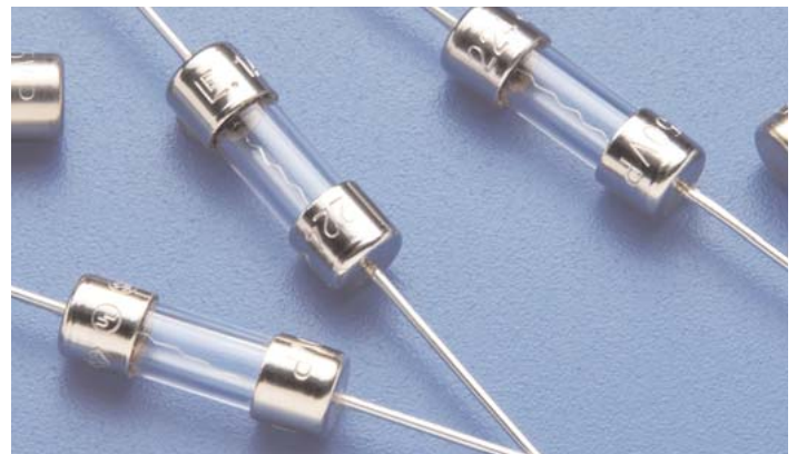
2205 000P Series

Wave solder- 500°F(260°C), 3 seconds Max. Reflow solder- Not recommended