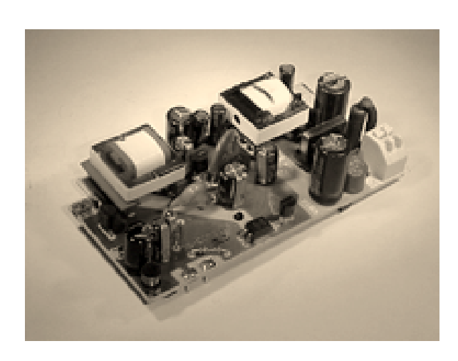
ORDERING NUMBER: GS-COMBI/E1