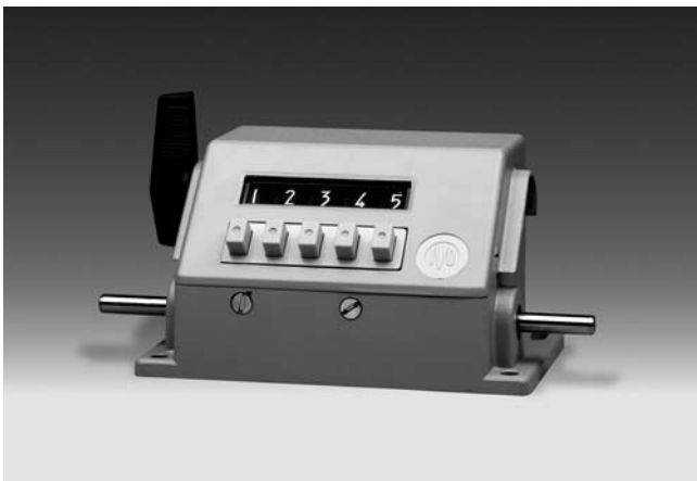
UE230 - Revolution counter