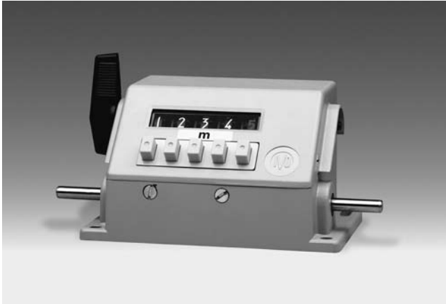
ME230 - Meter counter