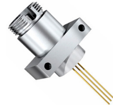
PD070-003-5xx FC Receptacle