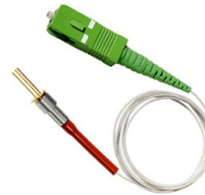
PD070-003-3xx SC/APC Pigtail