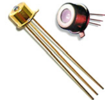
PD070-003-1xx TO can Package