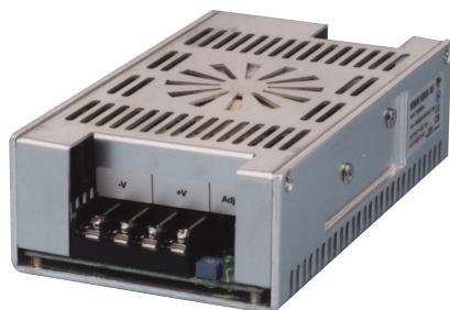
3"W x 5"L x 1.7"H