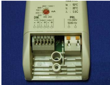
Input and Output Connections