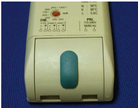
Easily Removable Cover