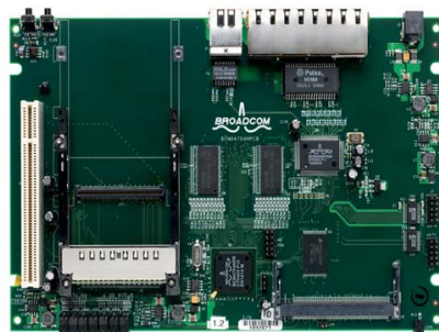
AP/Router Reference Design