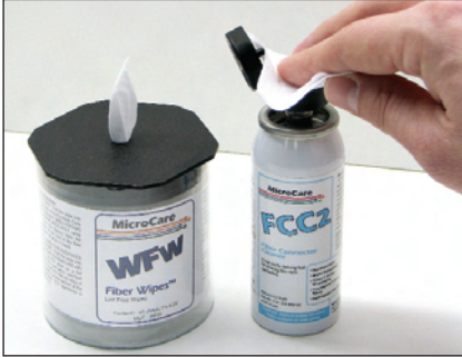
Optical-grade cleaning solvent and lint-free wipes remove stubborn contaminants