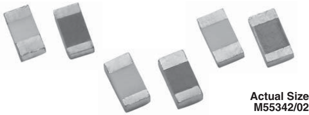
Actual Size M55342/02

Thin Film Mil chip resistors feature all sputtered wraparound termination for excellent adhesion and dimensional uniformity. They are ideal in applications requiring stringent performance requirements. Established reliability is assured through 100 % screening and extensive environmental lot testing. Wafer is sawed producing exact dimensions and clean, straight edges.