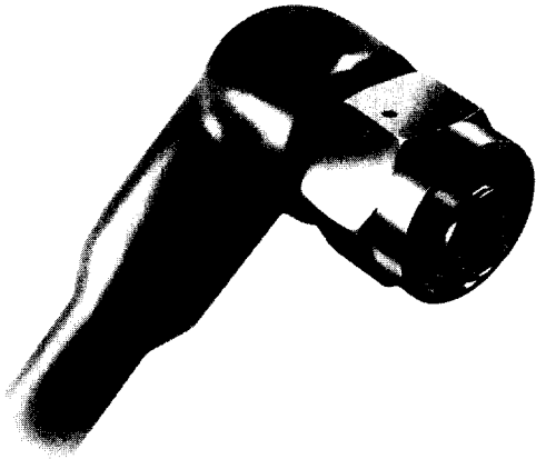
800-014 Cordsets Overmolded - Environmental