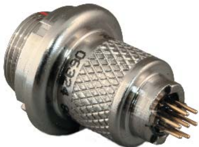
Series 804 Printed Circuit Board Receptacle

Series 804 Receptacles feature factory-installed non-removable contacts. Connectors are backfilled with rigid epoxy for a watertight seal.