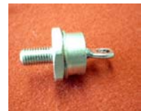
1N4510 Standard Rectifier (trr More Than 500ns)