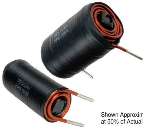
Shown Approximately at 50% of Actual Size

DASH NUMBER* ±10% (µH @ 1.00 kHz) INDUCTANCE MAXIMUM (OHMS) DC RESISTANCE MAXIMUM (OHMS) FREQUENCY SELF RESONANT MIN. (MHz) MAXIMUM (A DC) MIN. (MHz) CURRENT RATING MIN. (MHz)