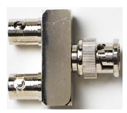
Model 6754 BNC (F/M/F) Adapter, In-Line 75 \Omega