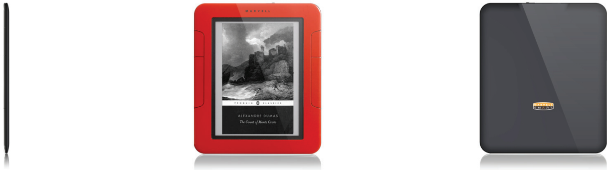
Fig 1. ARMADA 166E eReader Platform Reference Design

The eReader (or eBook reader) is shaping up to be the hot personal electronics item of 2009 and 2010. As more content goes online, consumers, enterprise users and students are all looking for more cost-efficient ways to utilize that content. The Marvell® ARMADA™ 166E application processor is built specifically for the eReader market, with a high-performance Sheeva™ CPU core running up to 800 MHz and a high level of peripheral integration, including a 5-in-1 card reader and USB host and OTG clients, and the option of either low-power Mobile DDR or low-cost DDR2 memory, allowing for very competitive system pricing. The ARMADA 166E is also the industry's first SoC with integrated e-paper display (EPD) controller, adding a new dimension of display performance and system cost reduction compared to competitive offerings. Marvell provides the most complete solution for eReaders on the market today with a complete platform offering including the ARMADA application processor, combination Wi-Fi/Bluetooth system-on-a-chip (SoC), power management, 3G HSDPA modem technology and a robust pre-integrated software environment.