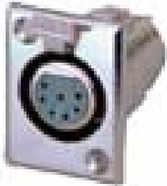
Model 6854 XLR (F) 5-pin rectangular flanged mount

Protect contacts and absorb vibrations in your audio applications.