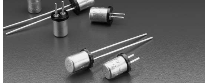
262 000 Series