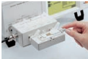
Example of connecting the 9262 and 9268 / 9269

The 9268 can be used for voltages up to a maximum of DC \pm 40 V. The 9269 can be used for currents up to a maximum of DC \pm 2 A.