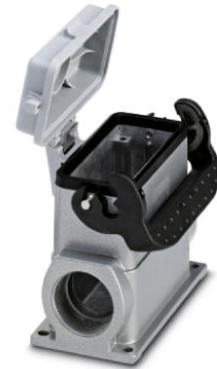
Photo shows product without screw connection

http://eshop.phoenixcontact.de/phoenix/treeViewClick.do?UID=1771176