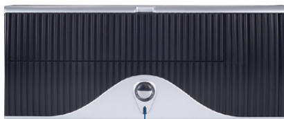
Power button with LED