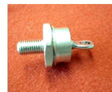
1N4510 Standard Rectifier (trr More Than 500ns)