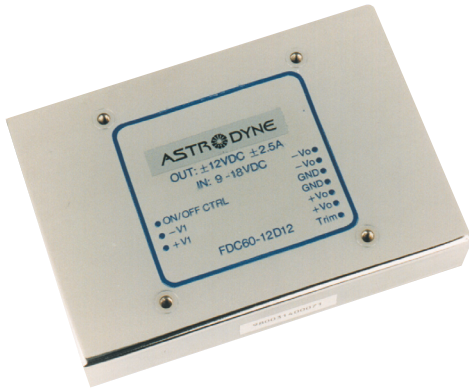
Unit measures 2.76"W x 3.94"L x 0.75"H