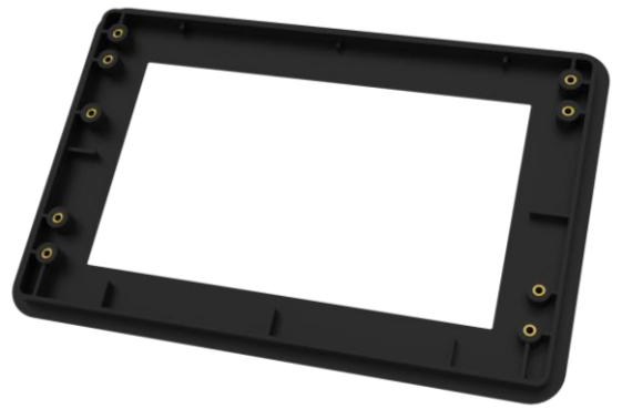
Bare 4.3" Bezel - Back