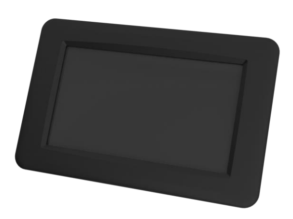
uLCD-43PT Mounted in 4.3" Bezel - Front