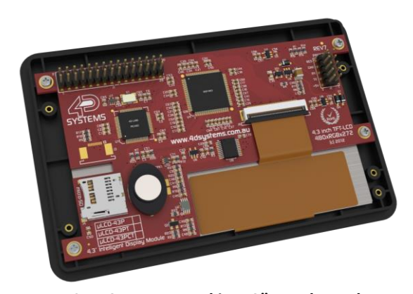
uLCD-43PT Mounted in 4.3" Bezel - Back