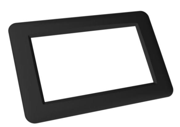
Bare 4.3" Bezel - Front