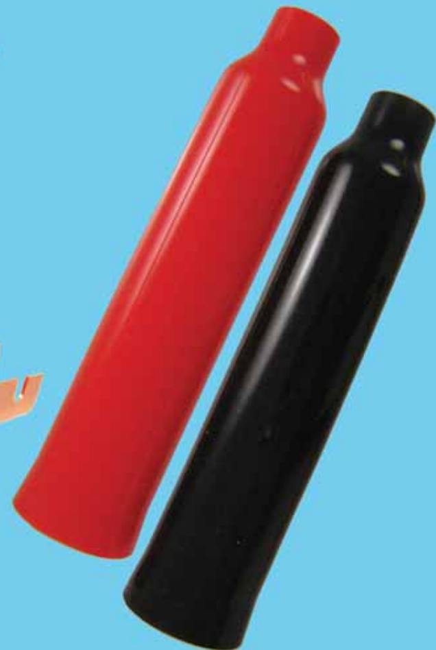
Insulator for the 501849 Series, {2 Req'd per clip}