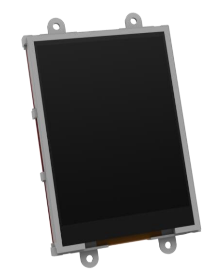
The uLCD-32-PTU Display Module