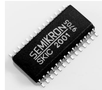
Package SOP 28