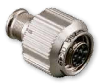
Series 801 Plug Connector

Glenair's Series 801 Mighty Mouse connector features a double-start modified stub ACME mating thread for improved protection against cross-mating and thread damage. Connector shells are machined aluminum or stainless steel, and are designed to accommodate (depending on insert arrangement) Glenair size 16, 20HD, or 23 fiber optic termini (termini sold separately.) Metal clips inside the connector body lock the termini into place. Termini are removable. Fluorosilicone seals and rear grommet protect the connector from water ingress. Choose hex or knurled coupling nut. Terminate cable shield directly to connector body with Band-Master™ strap, or choose rear accessory thread to attach optional backshell. Available in shell sizes 5 through 21 in 30 insert arrangements.