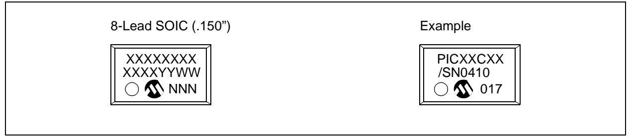
FIGURE 1: PACKAGING MARKING INFORMATION

In Section 15.1 "Packaging Marking Information", the marking for the 8-Lead SOIC (150 mil) is incorrect. The correct marking is shown in Figure 1.